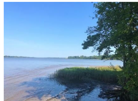
Hopewell, Virginia, where the Appomattox River meets the James River