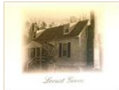
Locust Grove Notecard