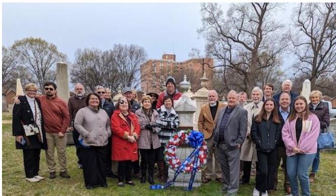
Wreath-laying ceremony at Shockoe Hill Cemetery