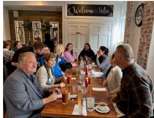
Society members enjoy brunch at The Parterre